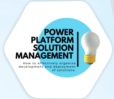
Power Platform Solution Deployment