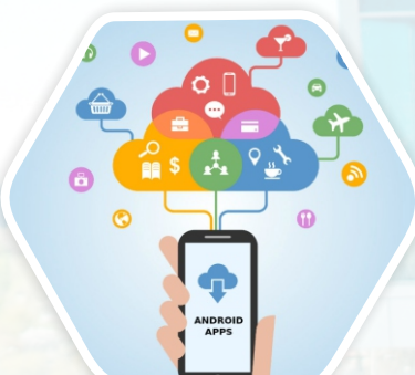
Web Dev / IOS & Android App Development