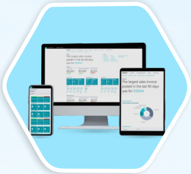
Microsoft Dynamics 365 Solution Deployment