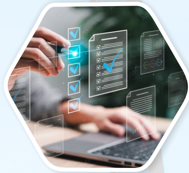
Business Process Automation Solutions