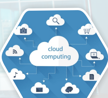
Azure Cloud Services