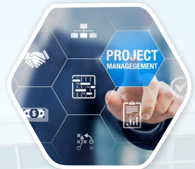
IT Project Management